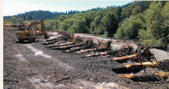
The backwater channel provides a needed resting place for the spawning fish.