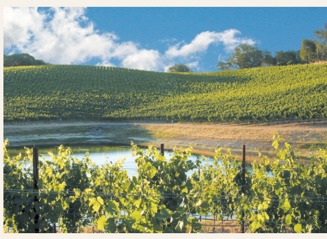
DCV9 - Estate Endeavour Vineyard, Lytton Springs

the vineyard its own water source. The planting of Endeavour