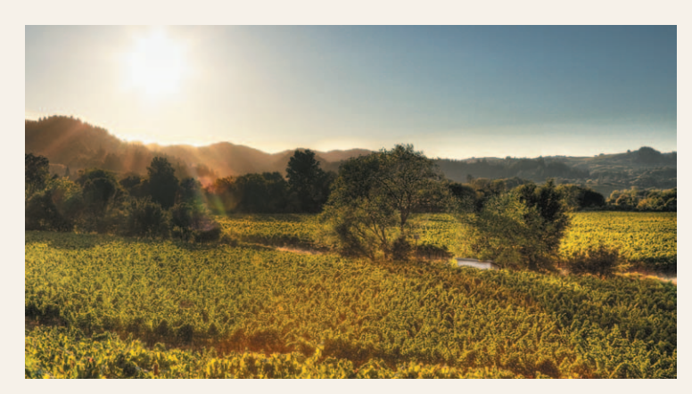
DCV6 - Bullock House Vineyard

As the years go on and new vintages are released, we are excited about what the future holds. We don't know exactly what we will get from these newly planted vineyards, but isn't that what makes wine so special? Finding that unexpected gem or new thing that keeps you learning and appreciating all that wine country has to offer.