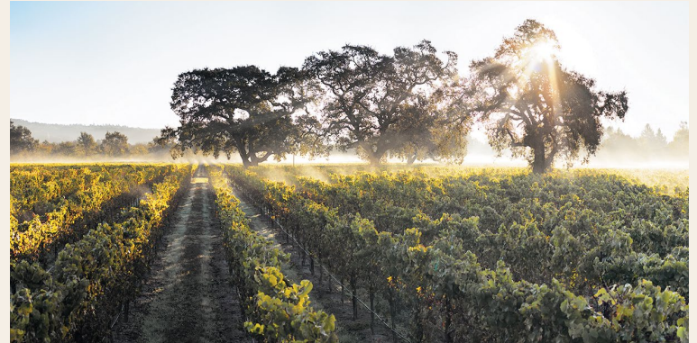
DCV Estate Block 10 Vineyard - Russian River Valley